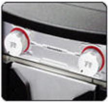
Luxury Aluminum speed control panel with 2 main Tt knob