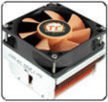
80x80x25mm Smart case fan II