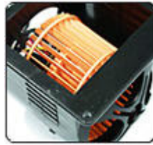
Two-way air induction, optimum air flow, can make air spread on the heat sink evenly