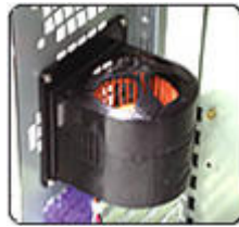
80x80x70mm Blower fan